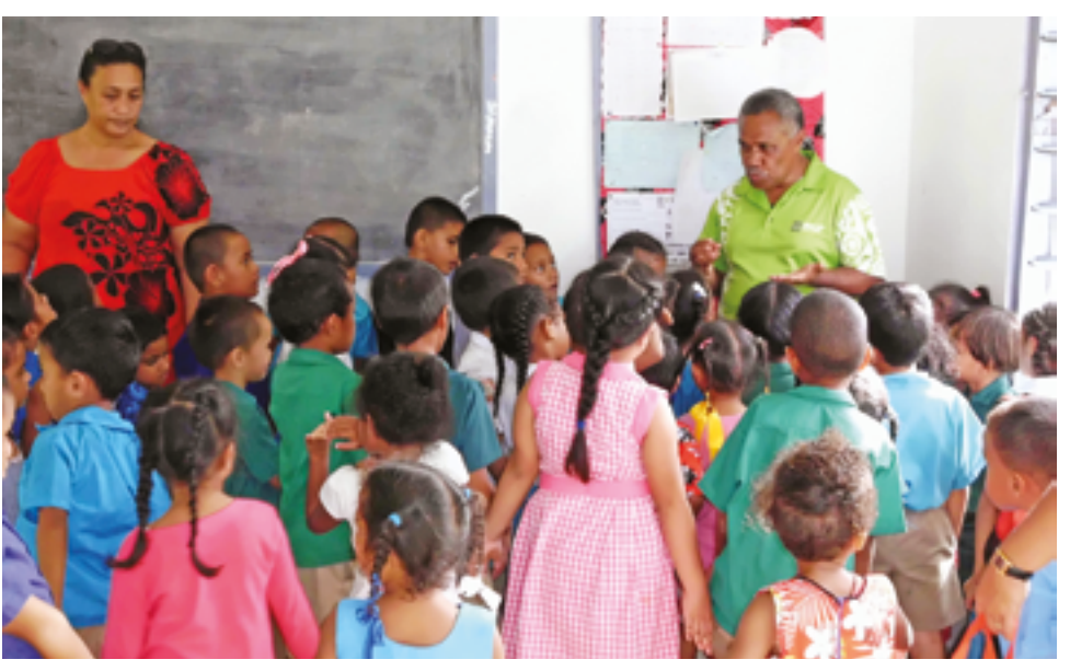
Ahau Primary School students learn how to earn and save money in Rotuma.

to make it the largest banking network in Fiji.