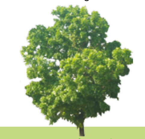
As a growing financial services provider in the Pacific, we have a special responsibility to our people, our customers and our vanua.

The Turaga in Yavusa of Nayararuku expressed his appreciation for the partnership between the Ministry of Forestry and BSP Life mentioning that the mahogany trees would be an investment for the future generation of the village.